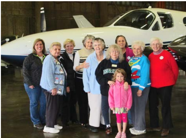
November meeting at Lost Nation Airport

The student is my pilot; Him I shall not want. He maketh me forced landings in rough pastures. He leadth me into trees and high tension wires. He destroyeth my confidence. He leadeth me into the path of incoming traffic, Yes, though I ride through the air in the shadow of death, I fear all evil. For he is with me, his stick, his throttle and his rudder confuse me. He prepares stalls and autorotations in the presence of all other planes. My temper runneth over; surely goodness and mercy have followed me all the days of my life and I shall be grateful if thou will spare my life and Let this YO-YO SOLO