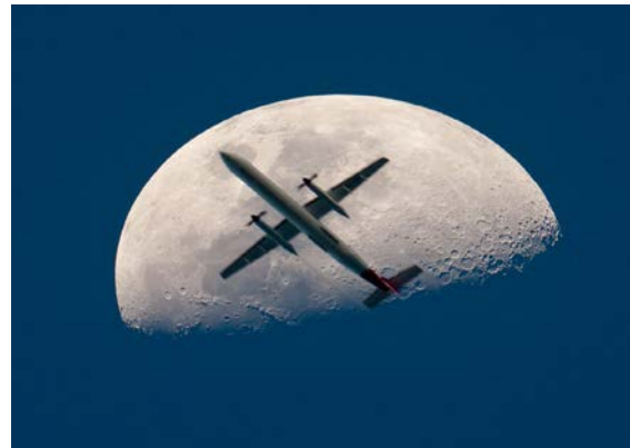
AN AIRPLANE CROSSES THE MOON